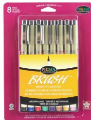
Sakura Pigma Brush 8-piece set