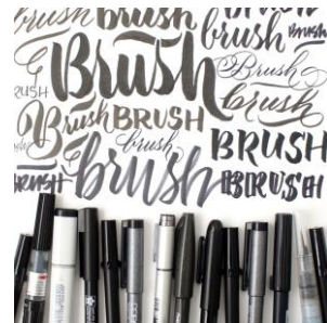
Brush Script (online course) By: Melissa Esplin (Use code PIECES for 10% off!)

Where to buy: Amazon , Tombow USA , Paper & Ink Arts , JetPens , & Blick . See more: http://piecescalligraphy.com/supplies