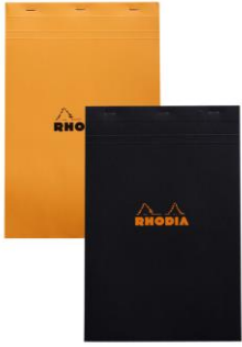
Rhodia Notepads Dot pad | Grid pad | Ice pad