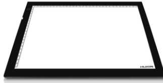
Huion Light Pad