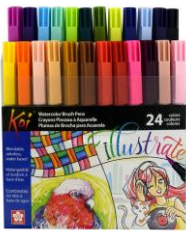
Sakura Koi Coloring Brushes 24-pack | 12-pack | 6-pack