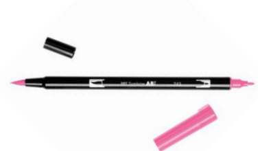
Tombow Dual Brush Pen Individual colors