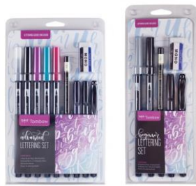
Tombow Lettering Sets Advanced | Beginner