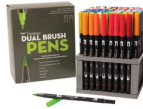
Tombow Dual Brush Pens 96-set | 10-pack bright | 6-pack