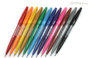
Pentel Sign Pens with a Brush Tip 12-pack | Individual